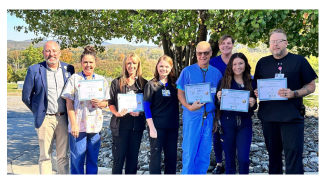
The Cardiac Cath Lab team celebrated another milestone in Door-to-Needle metrics.