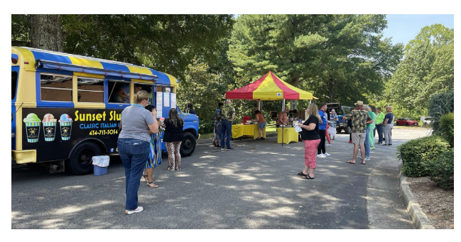
The Recruitment and Retention Council of Sovah Health – Martinsville hosted a Luau Day for community members and staff.